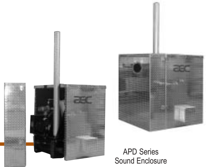
APD Series Sound Enclosure

The APD/APDB Series sound enclosure can be used with AEC's APD Series Vacuum Pump. The two-thirds/one-third clamshell design clamps easily around the pump, providing a minimum 15+ dba sound reduction.