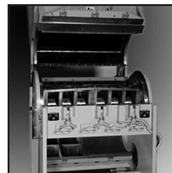
Easy access for maintenance and color changes