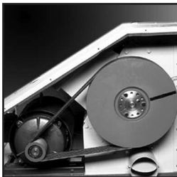
Heavy solid flywheel for added inertia