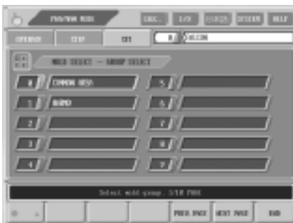
Features convenient mold data grouping, with easy retrieving and editing features