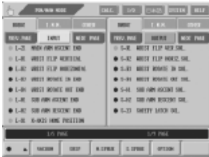
Two half-screen views allow simultaneous input and output monitoring