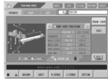
Manual maneuvering controls for maintenance