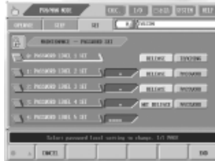
Password protected mold memories eliminate accidental deletion