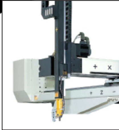
Beam mounted control box saves on floor space