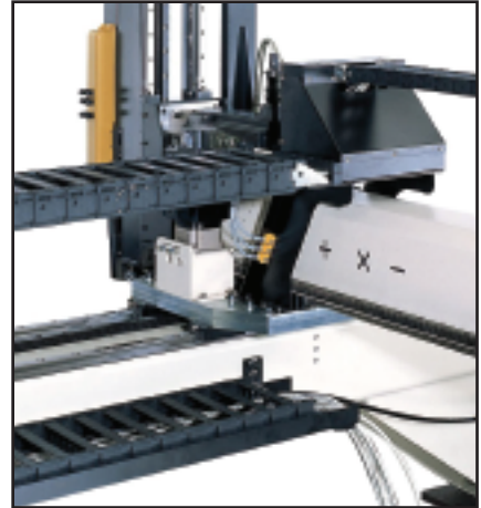
Rack and pinion gear on all 3 axes (models 1500 and higher)