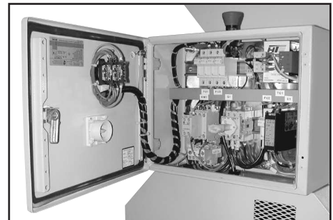
NEMA Type 12 enclosure for airtight, trouble-free electrical operation