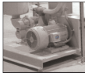
The heart of the system is a motor/blower assembly with an air-operated vacuum relief valve. The positive displacement blower is protected by a two-stage, high velocity filter assembly.