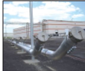
A railcar manifold aids the removal of material from the railcar into bulk storage silos.