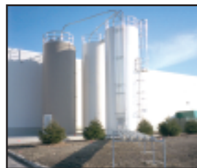
Material is separated from the airstream by a cyclone or filter receiver. Material drops through a rotary airlock and is conveyed by pressure to a takeoff into a silo.